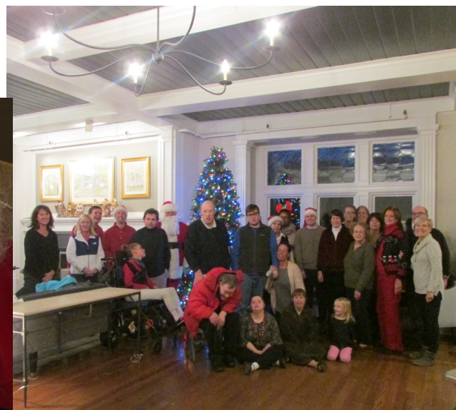
Special Church's Christmas Party