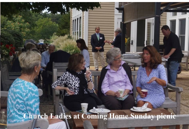
Church Ladies at Coming Home Sunday picnic