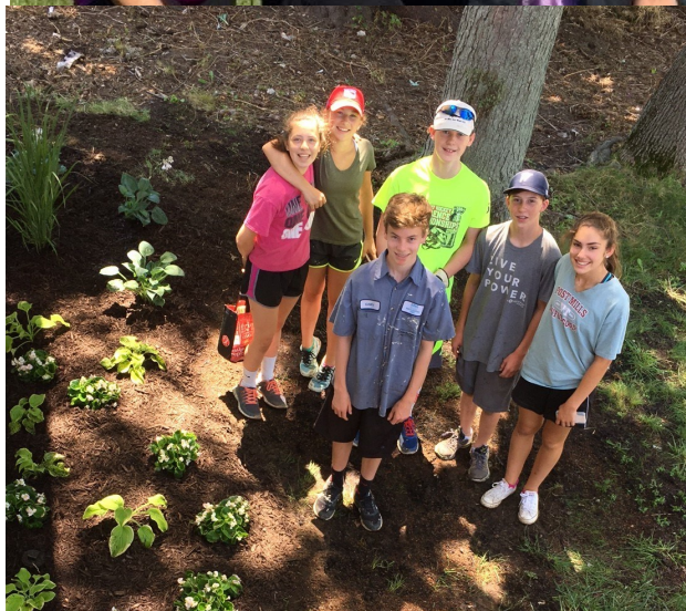
MSYG: Yard work at Union Beach, NJ