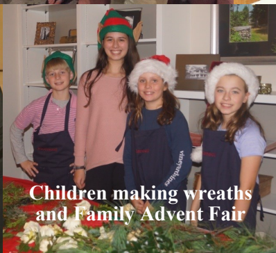
Children making wreaths and Family Advent Fair