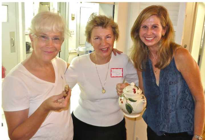
Senior Tea photos