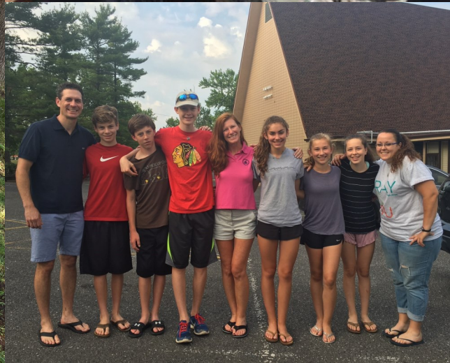
MSYG at Union Beach, NJ