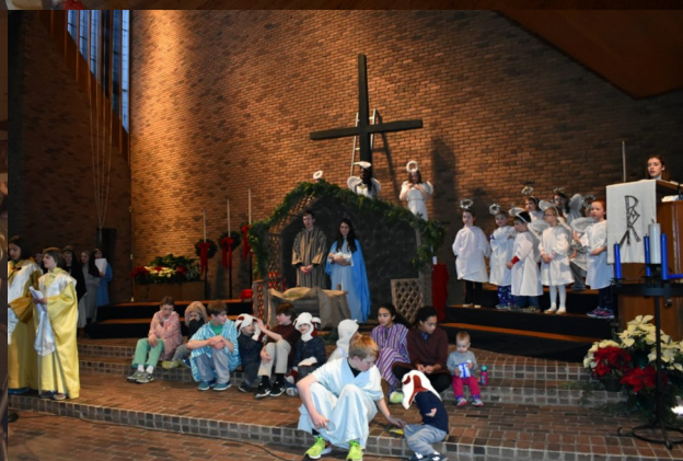
2016 Children’s Christmas Pageant