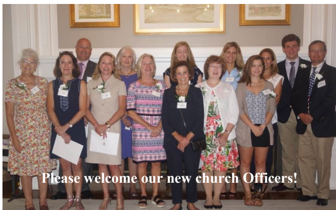
Please welcome our new church Officers!