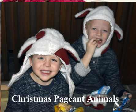
Christmas Pageant Animals