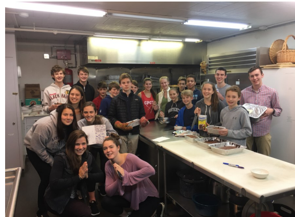
MSYG and HSYG Cooking for Domus