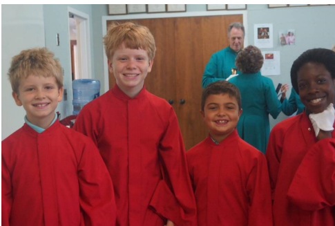
Carol Choir singers