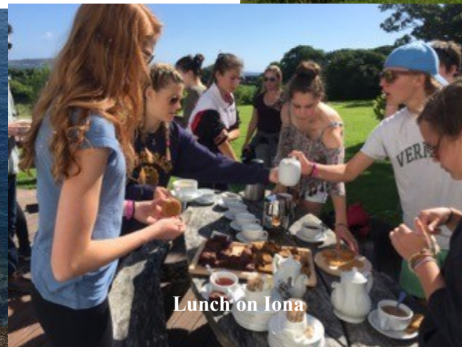
Lunch on Iona