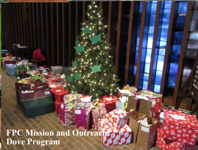
FPC Mission and Outreach Dove Program