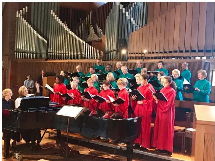
Our Carol Choir and First Presbyterian Church Choir