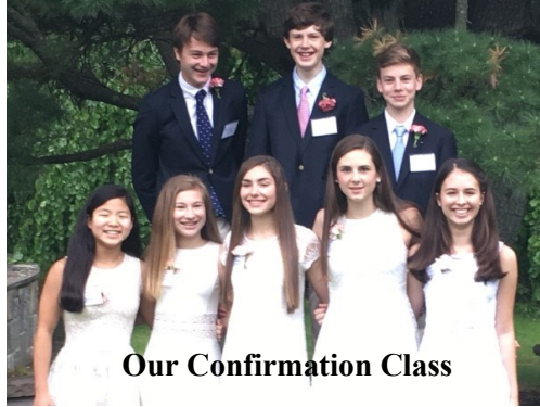
Our Confirmation Class